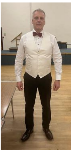
Suits you Sir

.....And finally (with apologies to Mick Jagger) in 2025 no colours any more we want it painted white !